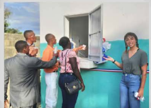
The OneChild Hope Center in Terrier Rouge celebrates the opening of a new solar-powered water kiosk.

Several initiatives planned for September thru February were postponed as a result of the earthquake and subsequent increases in violence, political unrest, gas shortages, and supply chain disruptions. By God's grace, the team has experienced recent breakthroughs and continues to work alongside Compassion International and other strategic partners to address the great many needs in Haiti.