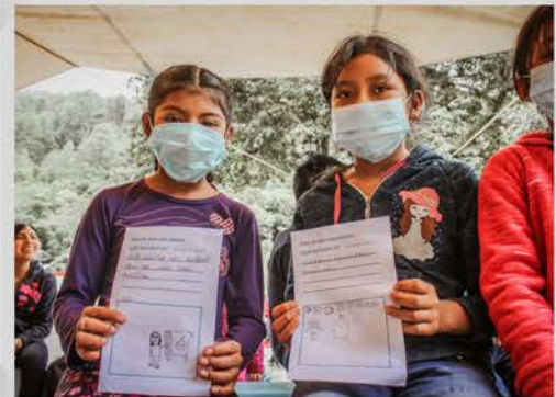
Students from the Vicente Guerrero secondary school in Chanal, Chiapas show off their completed Health & Hygiene lessons.