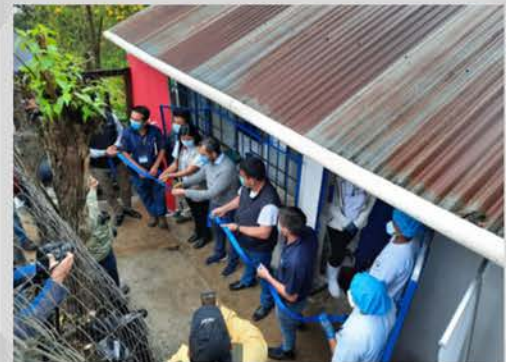
Nueva Esperanza made possible with donor funding matched with hurricane relief funds from Mercy Corps.