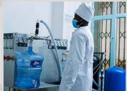
Rwanda worker bottles drinking water using eco-friendly ultra-filtration system designed and manufactured by HWI.