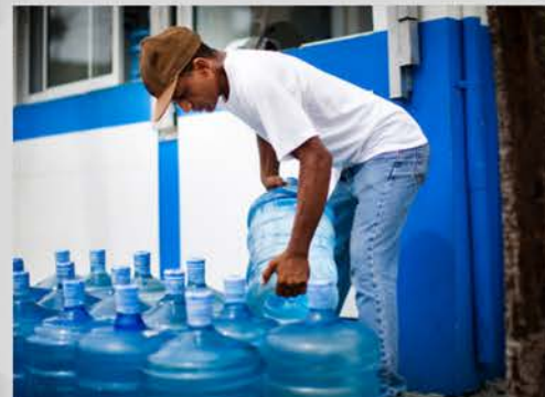
Nearly 90 community sites serve over 115,000 individuals daily with safe water.

HWI has been recognized as influential seed planters for the country's empowerment in local, private-sector water solutions, and today over 1,000 registered small business have reached over 95% of the population with affordable safe drinking water. Given this progress, our efforts in the region remain focused on supporting and maintaining existing project sites to ensure they continue to sustainably serve the nearly 23,000 families living in these communities.