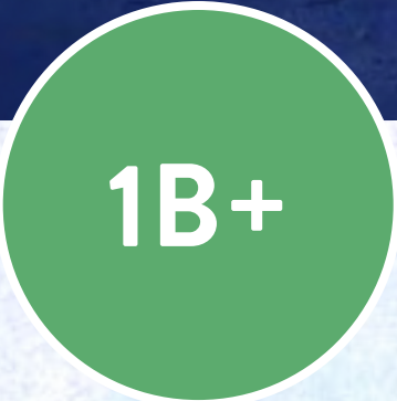
CUMULATIVE LITERS DISTRIBUTED