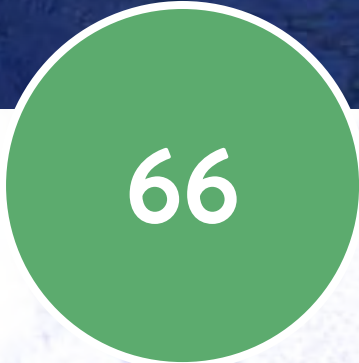
NEW PROJECT INSTALLS AND ACTIVITY IN 2016