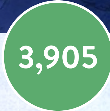
HEALTH AND HYGIENE BENEFICIARIES