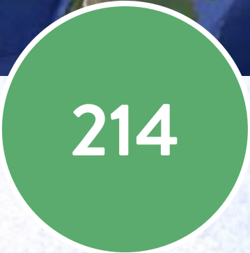
TOTAL ACTIVE PROJECTS