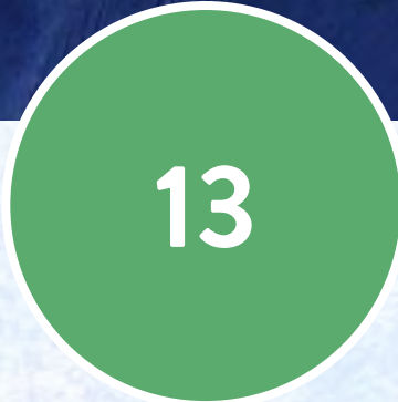
TOTAL COUNTRIES SERVED