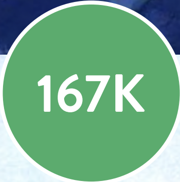
PEOPLE SERVED DAILY