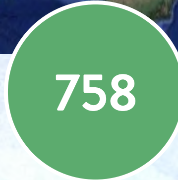
JOBS CREATED AT WATER PROJECTS